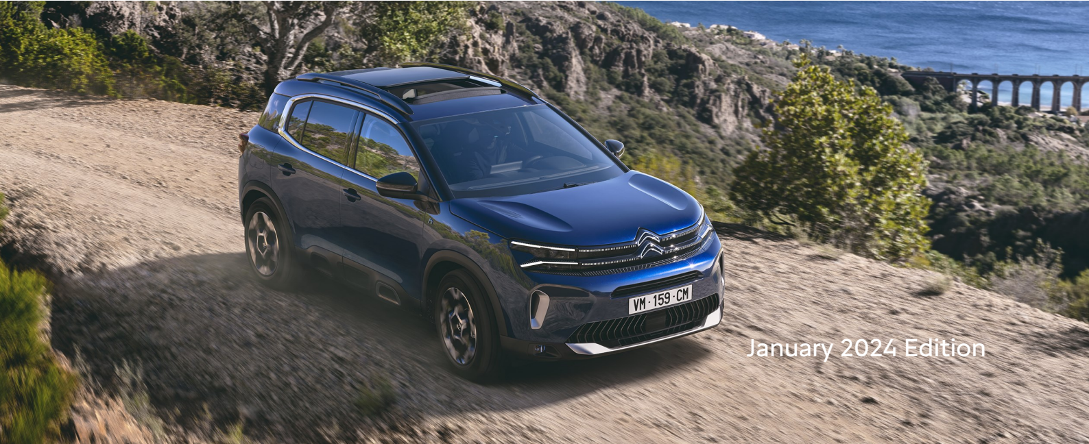
January 2024 Edition

● standard equipment O optional equipment (free choice) *Whichever comes first. Please refer to your authorised Citroën Dealer for further information.